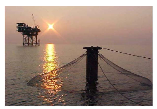
Figure 2.2.d: Industrial symbiosis? Oil platform and fish farm in the Gulf of Mexico.

President Bush signed the Energy Policy Act of 2005<sup>56</sup> on August 8, 2005. Section 388 of the Energy Policy Act amends Section 8 of the Offshore Continental Shelf Lands Act (OCSLA)<sup>57</sup>, authorizing the Secretary of the Interior to grant leases, easements, or rights-of-way on the OCS for the development and support of alternative energy resources such as wind, solar and currents, and also to allow for "alternate uses" of existing facilities on the OCS, including OOA.<sup>58</sup> The DOI delegated authority to MMS, who, as lead agency for the permitting of alternative uses, is developing its OCS "Alternative Energy and Alternate Use program", to develop a