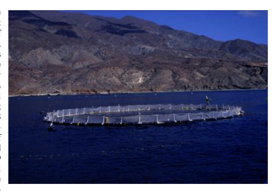
Figure 2.2.3: "Gravity cage" type fin fish enclosure.

The fate of the Grace Mariculture project resembles that SeaFish Mariculture, which, at 34 miles offshore Texas, was the first aquaculture facility associated with commercial offshore oil industry. After securing permits, in 1998 SeaFish actually commenced production of red drum, but ended only a year later in 1999 because Shell Oil decided to reactivate the platform for elopment of a nearby gas well.54