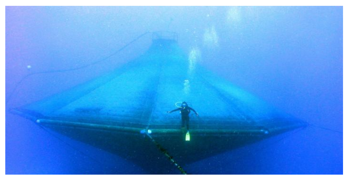
Figure 2.2.2: Submerged, "semi-rigid" fin fish enclosure at a pilot OOA facility offshore Puerto Rico.

Platform Grace is located in federal waters about 330 feet deep and approximately 3 NM from the CINMS boundary <sup>47</sup> (see figure 2.2.1 , above). The Grace Mariculture plan includes use of about 2.4 square kilometers (about 593 acres) of surface area around the facility, including two submerged "semi-rigid" cages, two "gravity cages" (pens suspended from circular floats) (see figures 2.2.2 and 2.2.3, below), and approximately 19 "culture pools" on the main platform deck for hatchery and nursery operations. <sup>48</sup> The project would involve farming shellfish and fin fish, specifically mussels, abalone, striped bass (non-native), white sea bass, rockfish, California halibut, California yellowtail, and bluefin tuna. <sup>49</sup> A consultant report expected that the project would "produce approximately 100-300 metric tons (MT) of marketable seafood product annually ... and ... test critical components of a commercial scale operation." The pilot scale phase of the project was expected to last three years and, if proven feasible, the applicant planned