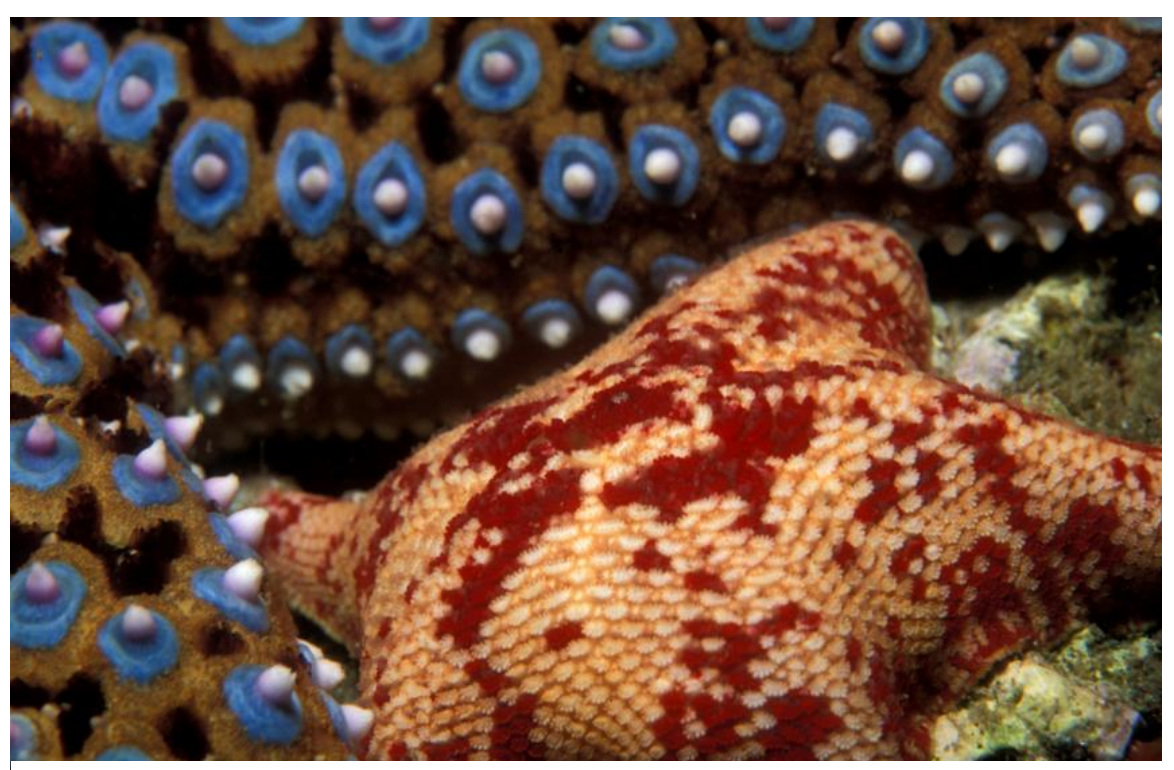
Figure 3.3 Benthic community members at Santa Cruz Island: bat star and giant spined sea star.

As mentioned in the opening sections, the deep waters and steady currents of open-ocean (EEZ) settings are attractive to aquaculture proponents such as the Bush administration in part because of the increased dilution power of this environment for the diverse and potentially toxic discharges and concentrated waste streams originating at commercial fish farms. Data demonstrate that these pollutants can cause harsh local environmental impacts; unfortunately, while open ocean settings may reduce the acuity of a given fish farm's pollution stream, other factors suggest that OOA discharges could cause similar problems in their environmental setting to those of fish farms situated in coastal settings.