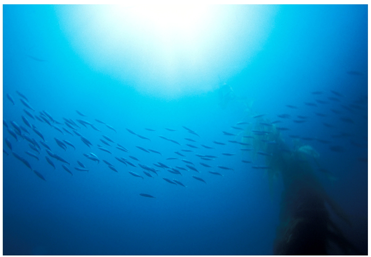
Wild Pacific sardines (Sardinops sagax) off Santa Cruz Island.

An emerging challenge for the Channel Islands National Marine Sanctuary